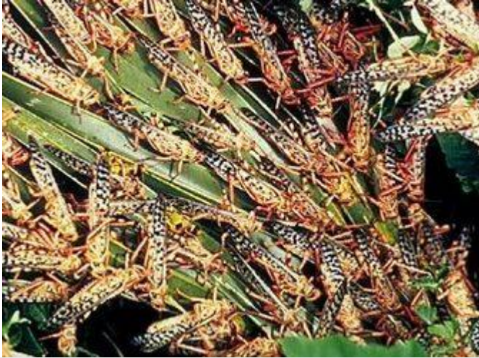
Figure 1: Swarms of locusts exceed carrying capacity with huge population sizes.

Large populations experience their own problems. As they approach the maximum sustainable population size, known as carrying capacity, large populations show characteristic behavior. Populations nearing their carrying capacity experience greater competition for resources, shifts in predator-prey relationships , and lowered fecundity. If the population grows too large, it may begin to exceed the carrying capacity of the environment and degrade available habitat (Figure 1).