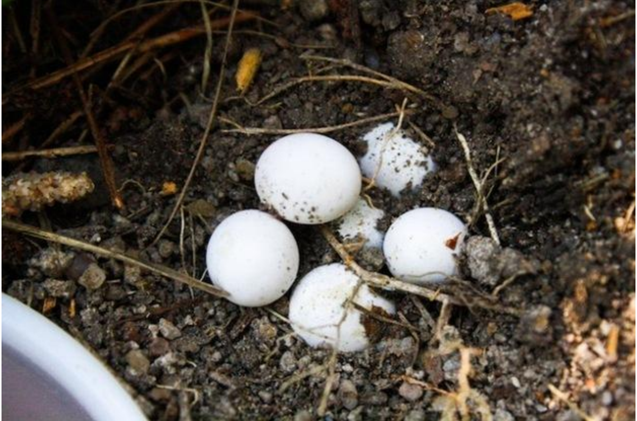
Figure 4: A communal nest of skink eggs displays the fecundity of several individuals.

© 2012 Nature Education Photo courtesy of Kika Tarsi. All rights reserved.