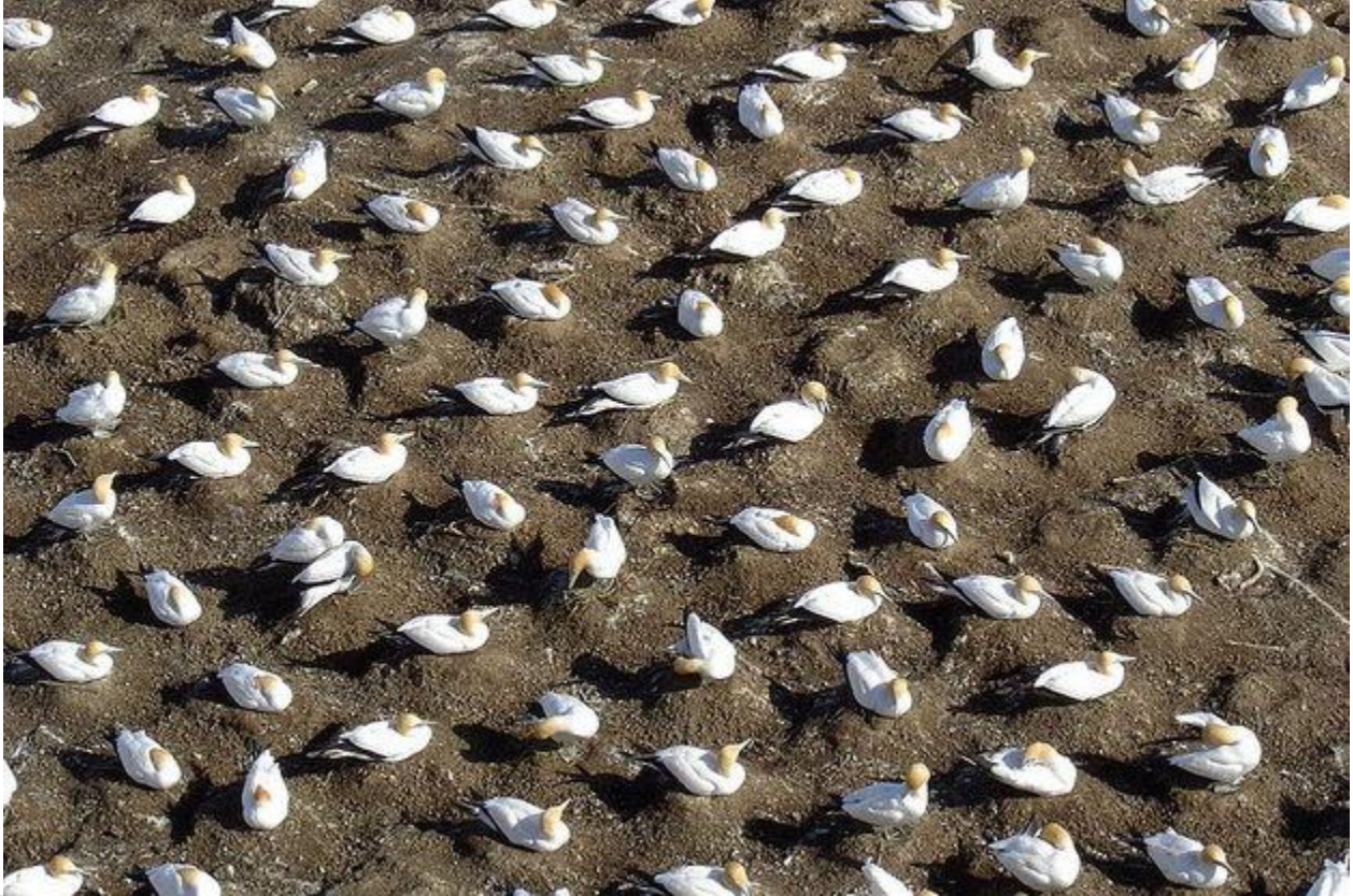
Figure 2: Gannets can persist at very high densities.

They have developed exaggerated territorial behavior as an adaptation to sustain these densely packed colonies.