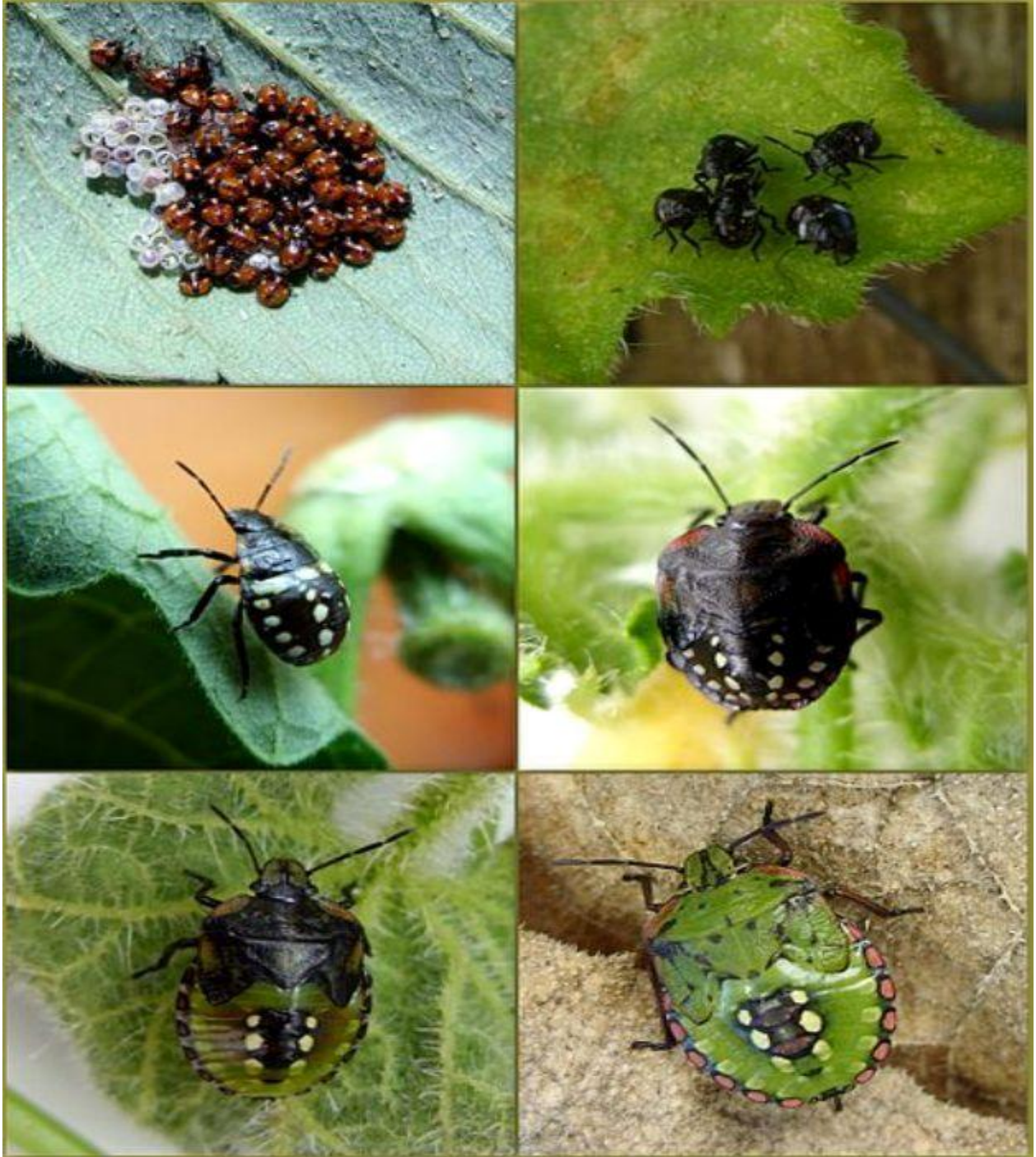
Figure 5: The Green Stink Bug ( Nezara viridula ) assumes different body forms through metamorphosis between different discrete life stages.